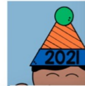
Face option 2 - copy on skin colored paper