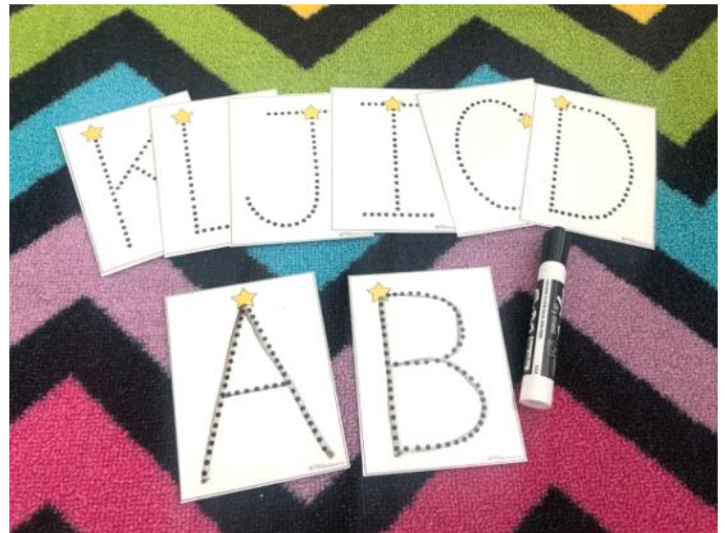
Uppercase letter formation