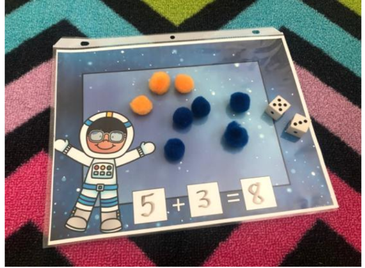
Addition/Subtraction with dice