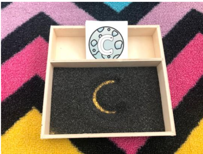
Lowercase letter formation