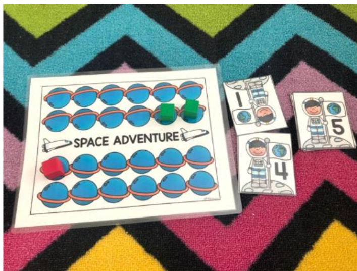
Identifying more and less