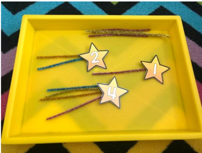
One to one correspondence