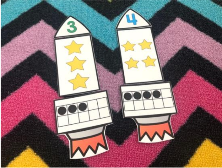
Build a rocket