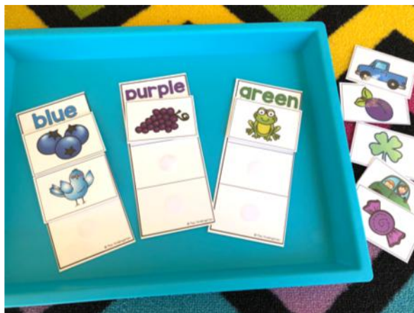
Color words practice