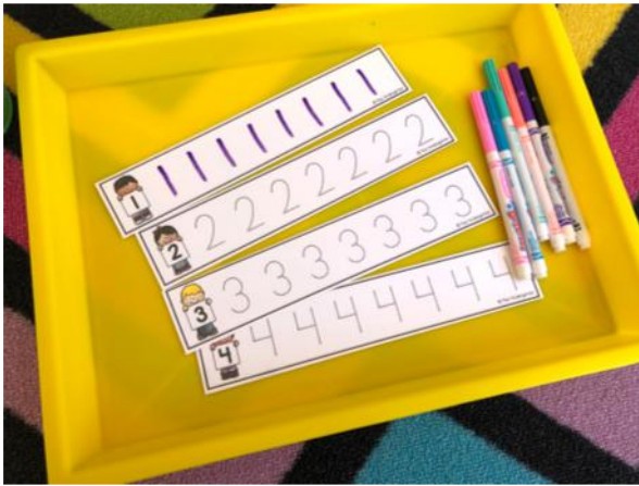
Number tracing practice