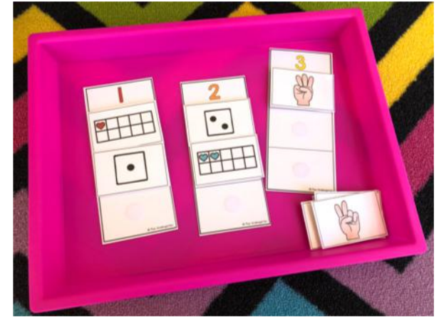
Count & match