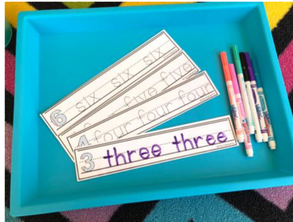
Number word practice