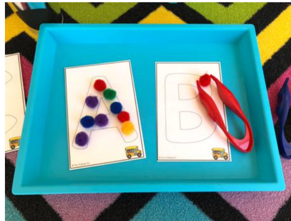
Fine motor practice