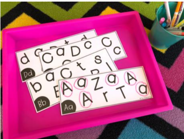
Letter recognition practice