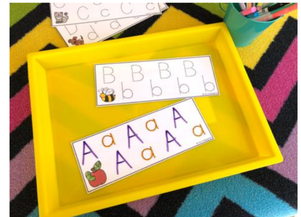
Letter tracing practice