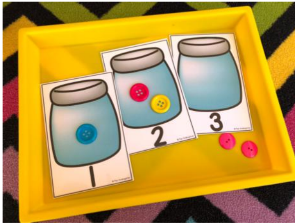
Buttons in a jar