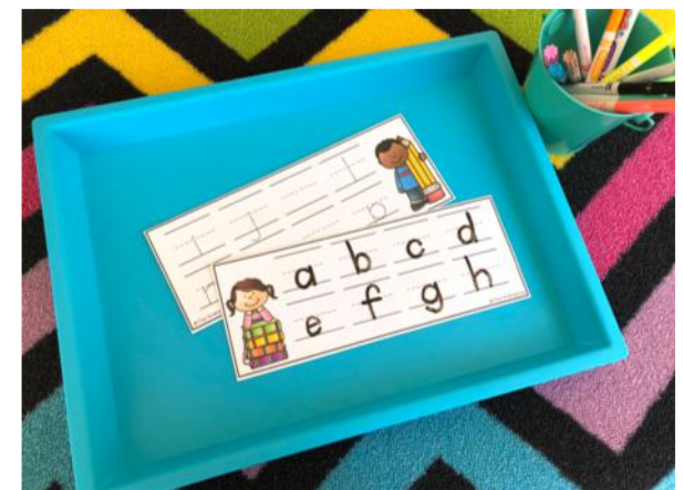
Missing letter practice