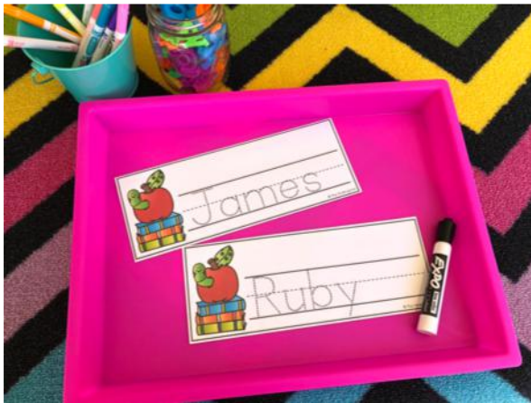
Name writing practice