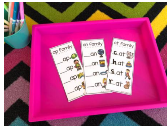
Beginning sounds practice