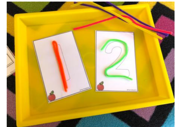
Fine motor numbers