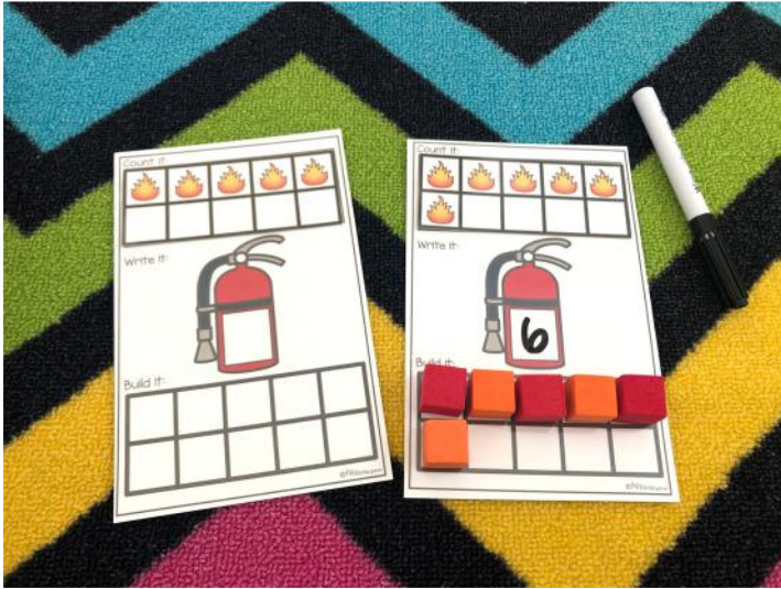
Ten frames 1-10