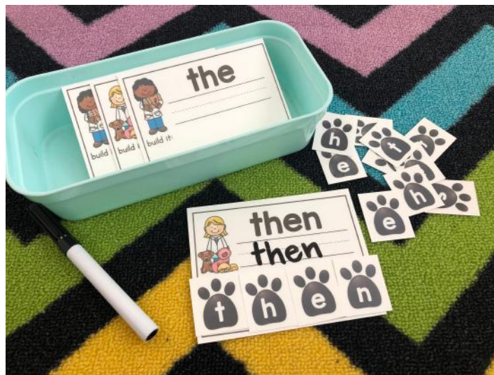
Sight words practice