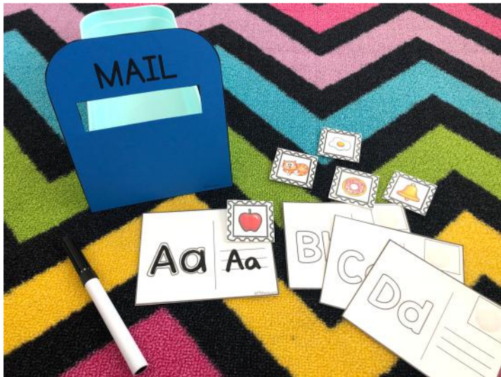
Beginning sounds practice