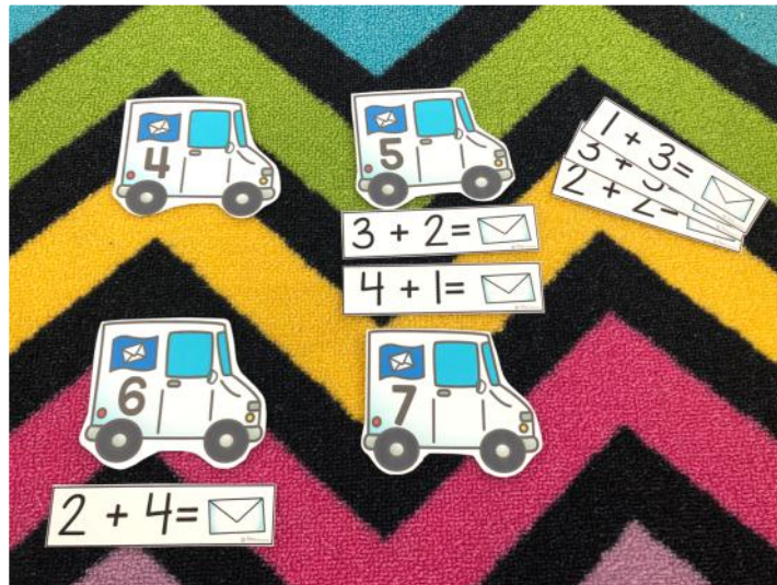
Addition and subtraction practice