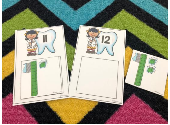
Base ten numbers 11-20