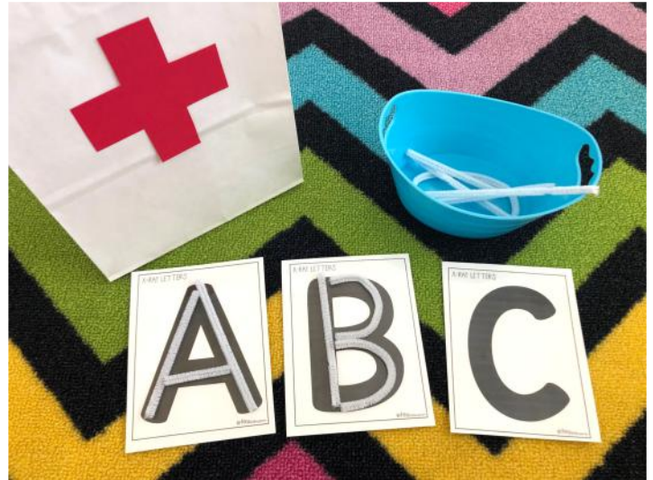
Uppercase letter formation