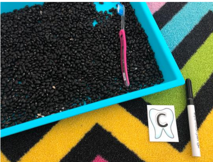
Lowercase letter formation